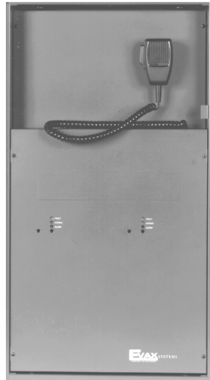
EVAX 200 shown with Keylocked Door Removed