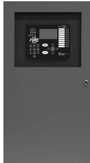
EF2 shown in optional GRAY cabinet