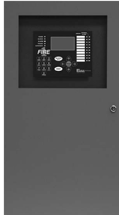
EF1 FACP shown in optional GRAY cabinet