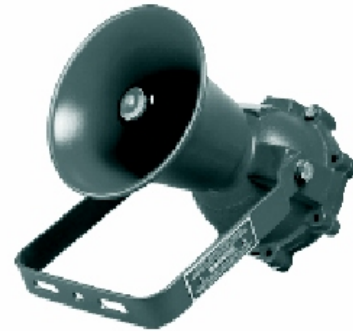
Evax Model EF-CPG-SPHX Explosion-proof Speaker